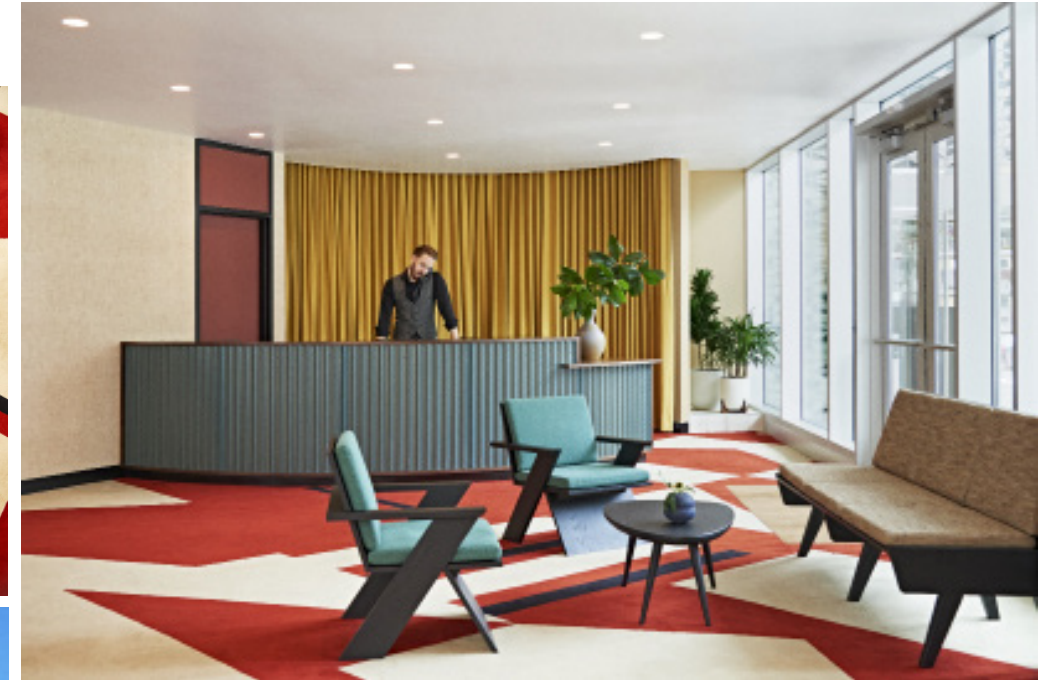
Back to the Future: The Durham Hotel's space-age architecture, bold prints, and Mid-Century Modern décor are a fashion-forward take on nostalgia.